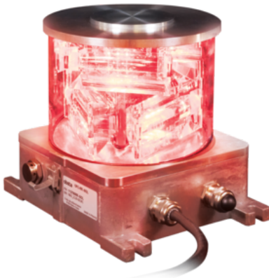
Patents: EP 1966535B1 & US 7816843

Red medium intensity FAA L-864 (AC 150/5345-43J) ETL certified