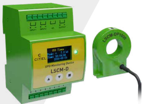
Complete unit LSCM-D/24/P1000