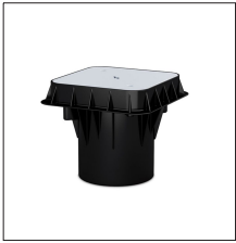
AT-010H 250x250x250mm polypropylene earth pit