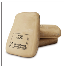
AT-032L 25kg bag APLIFILL