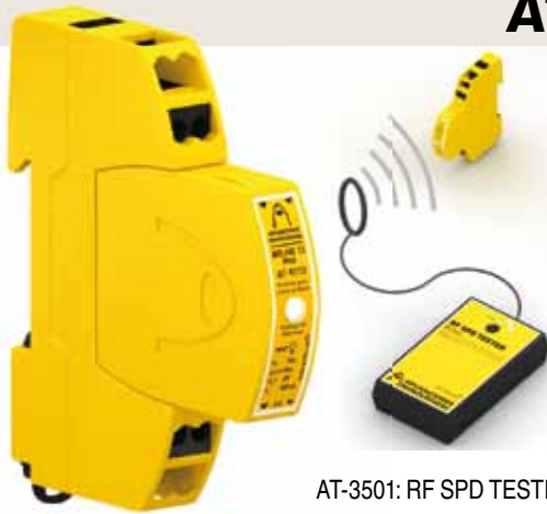
AT-3501: RF SPD TESTER: Radiofrequency SPD tester.